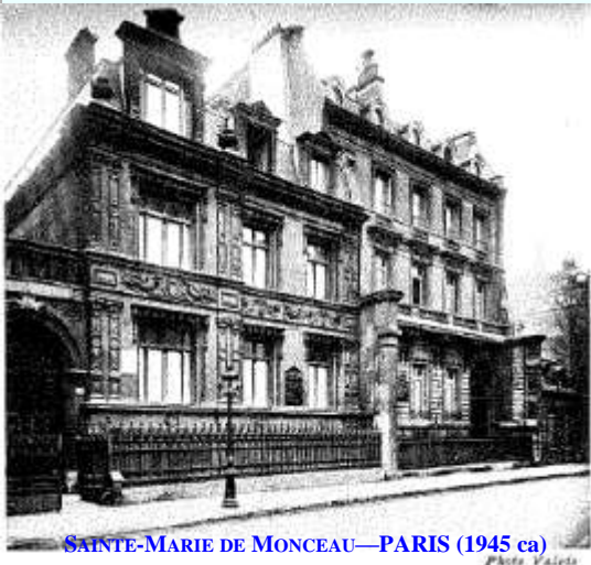
SAINTE-MARIE DE MONCEAU—PARIS (1945 ca)

One element of interest to us is that the prior of that community, Father Christian de Chergé, and his brothers were our students in Paris, at the Collège Sainte-Marie de Monceau; the school was later transferred to Antony