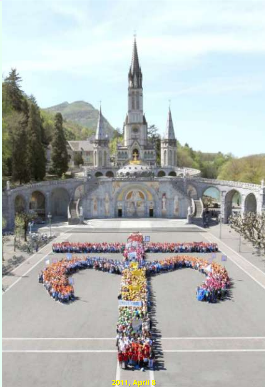
2011, April 8