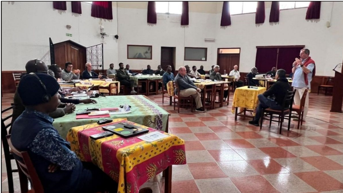
Final evaluation session and conclusions of the Nazareth 2026 meeting.

All of this has implications for our current Guide for Formation , which needs to be revised and updated in the coming years.