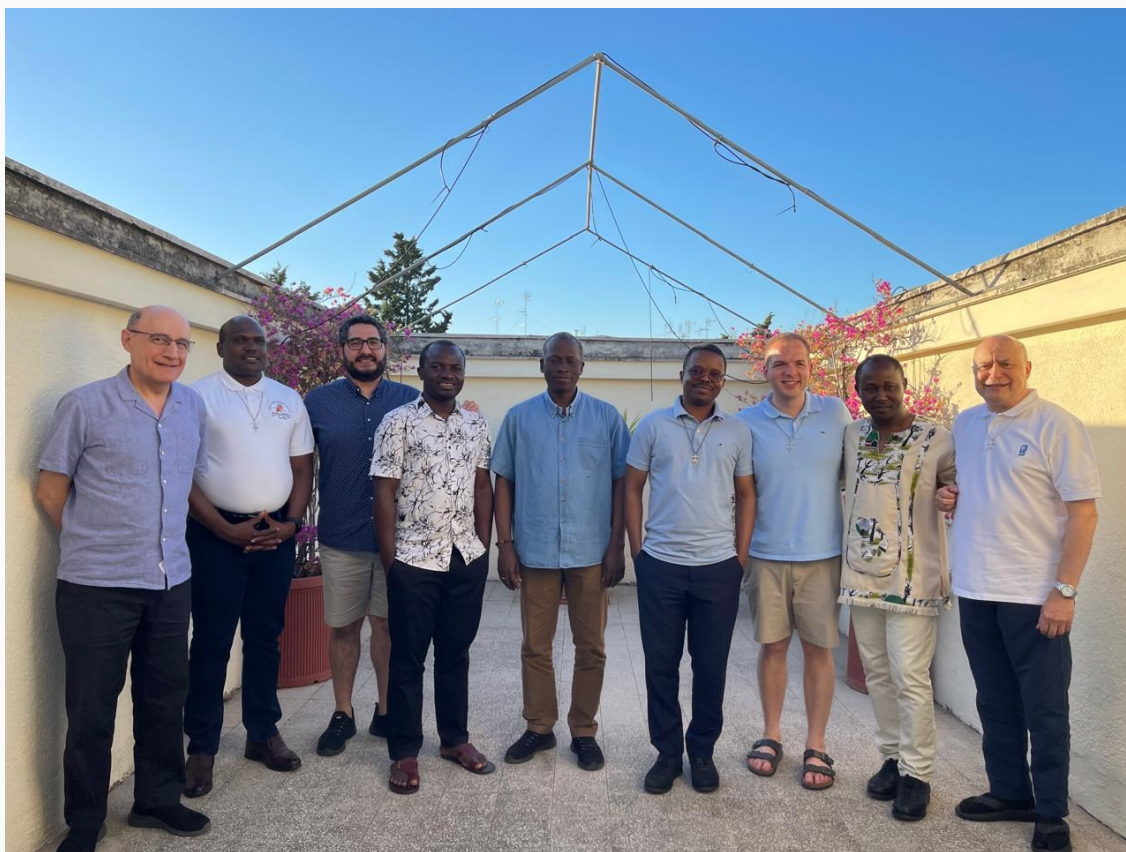
The nine brothers who are leaving VL22.