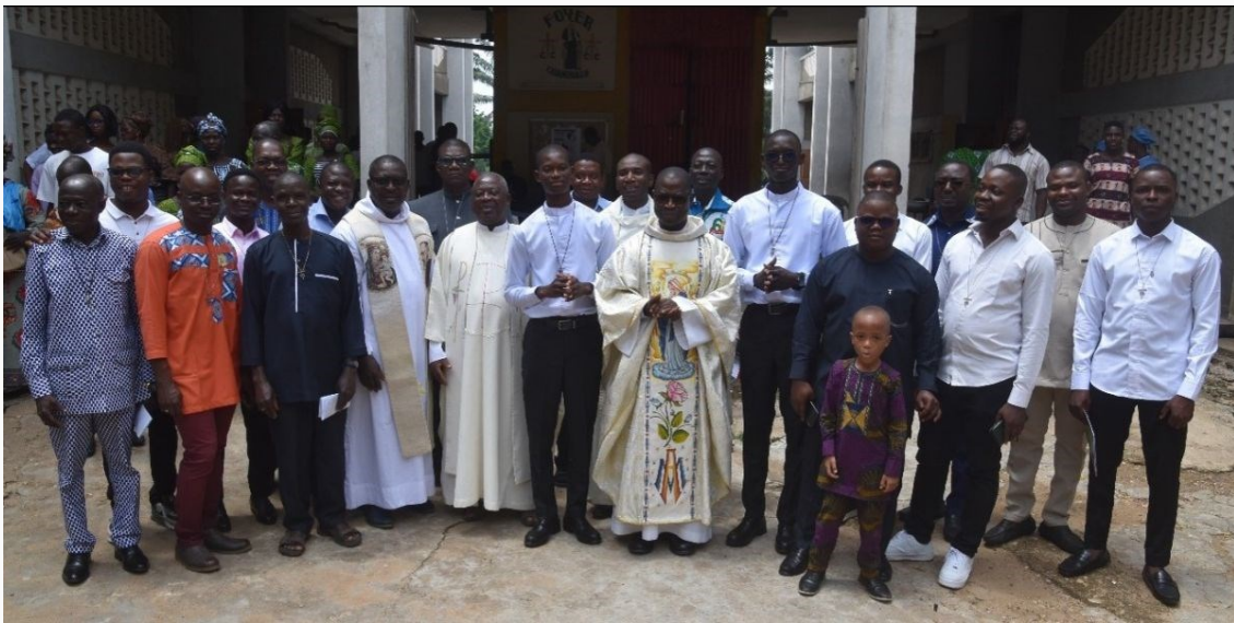
The newly professed, surrounded by Marianist Brothers and two diocesan priests

The choir of the College joyfully embellished the liturgy with the beautiful songs. A large number of faithful, members of biological families and guests gathered to accompany the newly Professed. Likewise, all the branches of the Marianist Family were present.