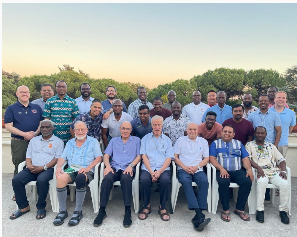
The Marianist Brothers in Via Latina 22, June 13, 2026.