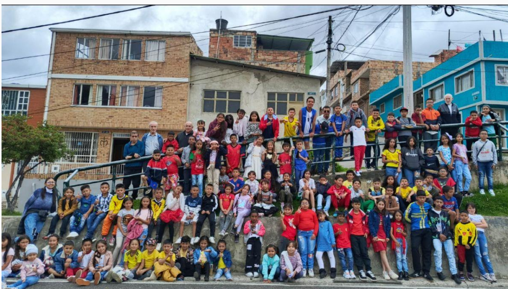
Bogota, Children from the school support centers and brothers in front of the community of the Blessed Chaminade parish.

The Marianist Family is well represented in Colombia as well as in Ecuador, by a strong presence of Marianist Lay Communities and Marianist sisters. There is an opportunity for everyone.