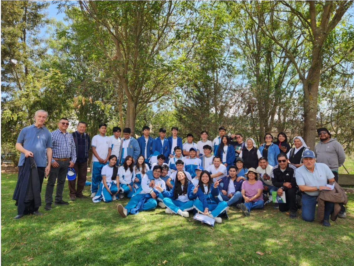
With students, SM and FMI from the Colegio Hermano Miguel (Latacunga, Ecuador)

The Marianist Family is well represented in Colombia as well as in Ecuador, by a strong presence of Marianist Lay Communities and Marianist sisters. There is an opportunity for everyone.