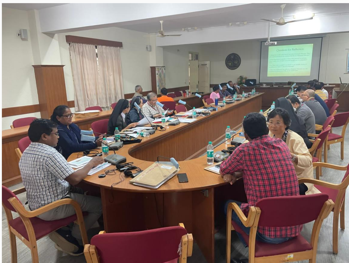
Participants in a meeting.