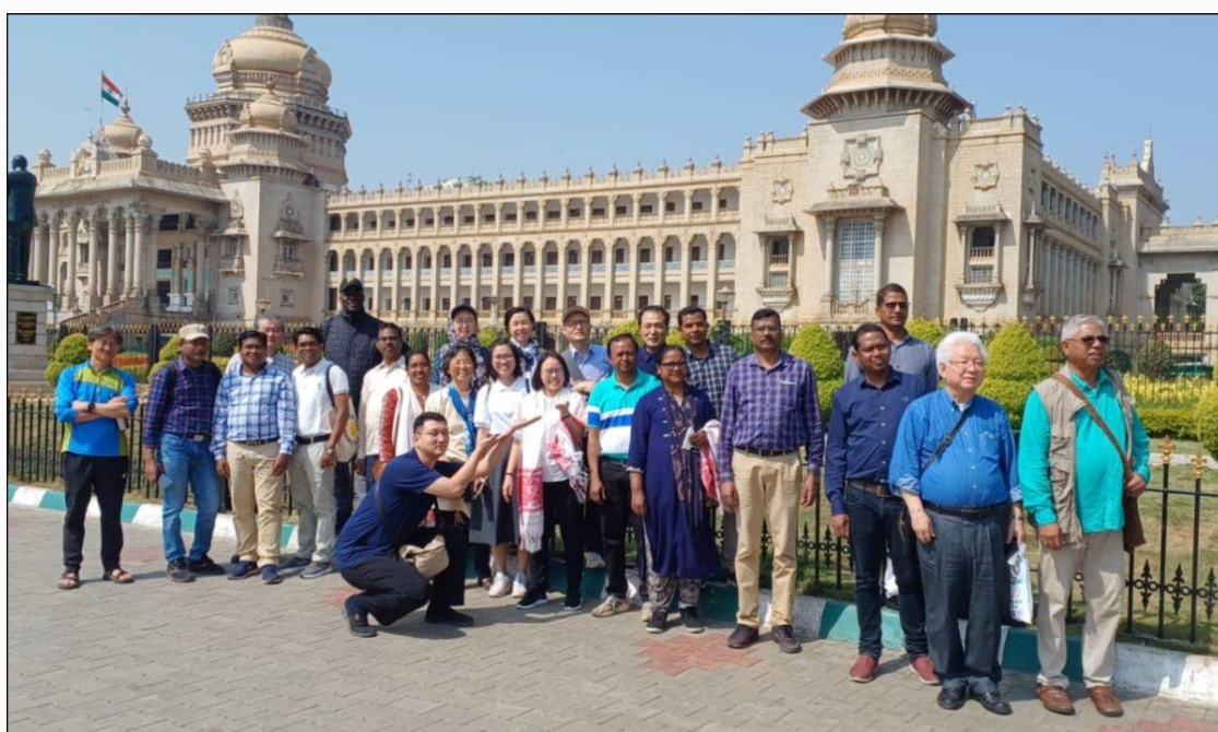
Participants outside Karnataka State Parliament, Bangalore.