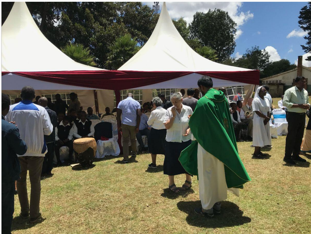
Novitiate, Limuru - Kenya