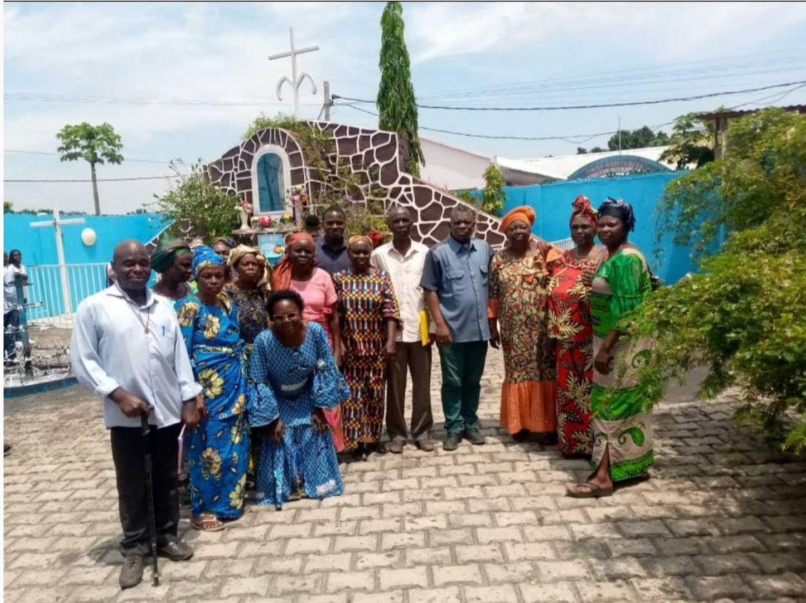
Saint Rita of Moukondo, Brazzaville - Democratic Rep. of Congo