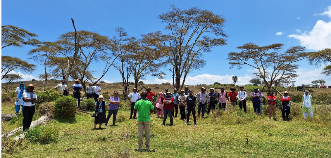
The Nazareth group on Crescent Island in Naivasha during an excursion