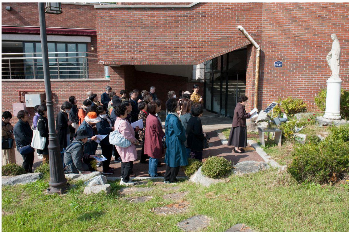
Marianist Center, Goyang - Korea