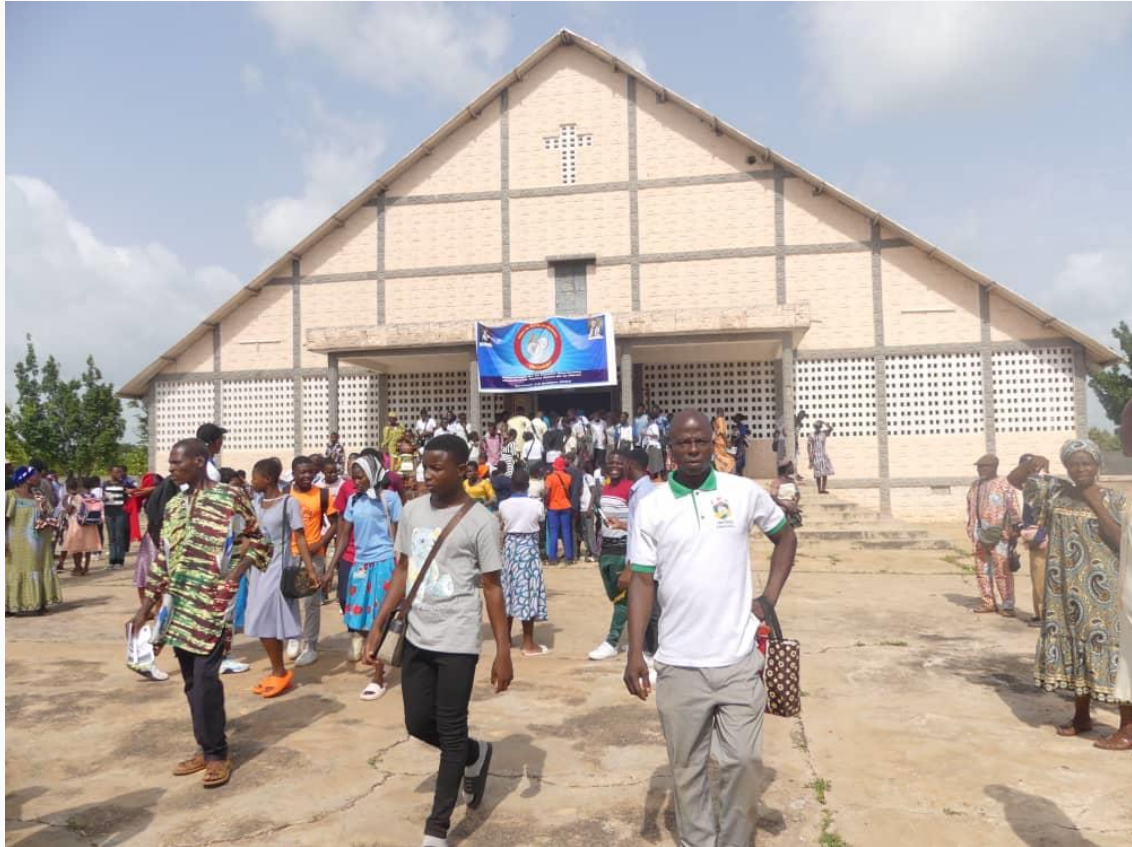
Marian Sanctuary of Our Lady of Mercy in Sotouboua - Togo