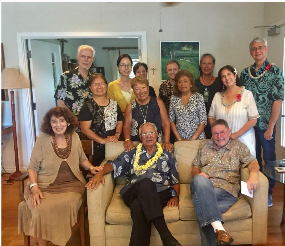
Honolulu, Hawaii - U.S.A.