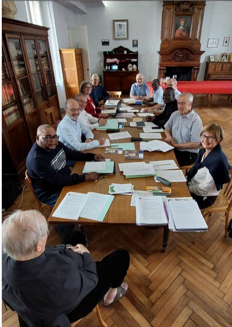
Meeting of the Madeleine Association, September 2023