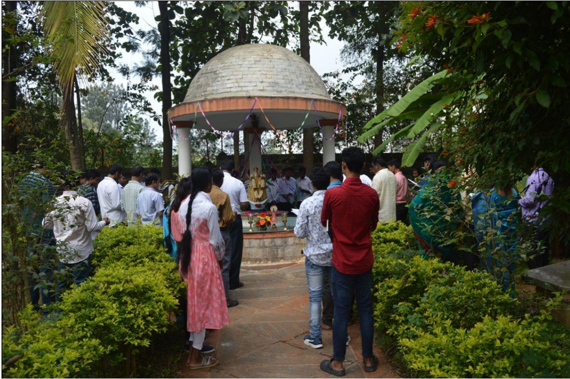
Deepahalli - India