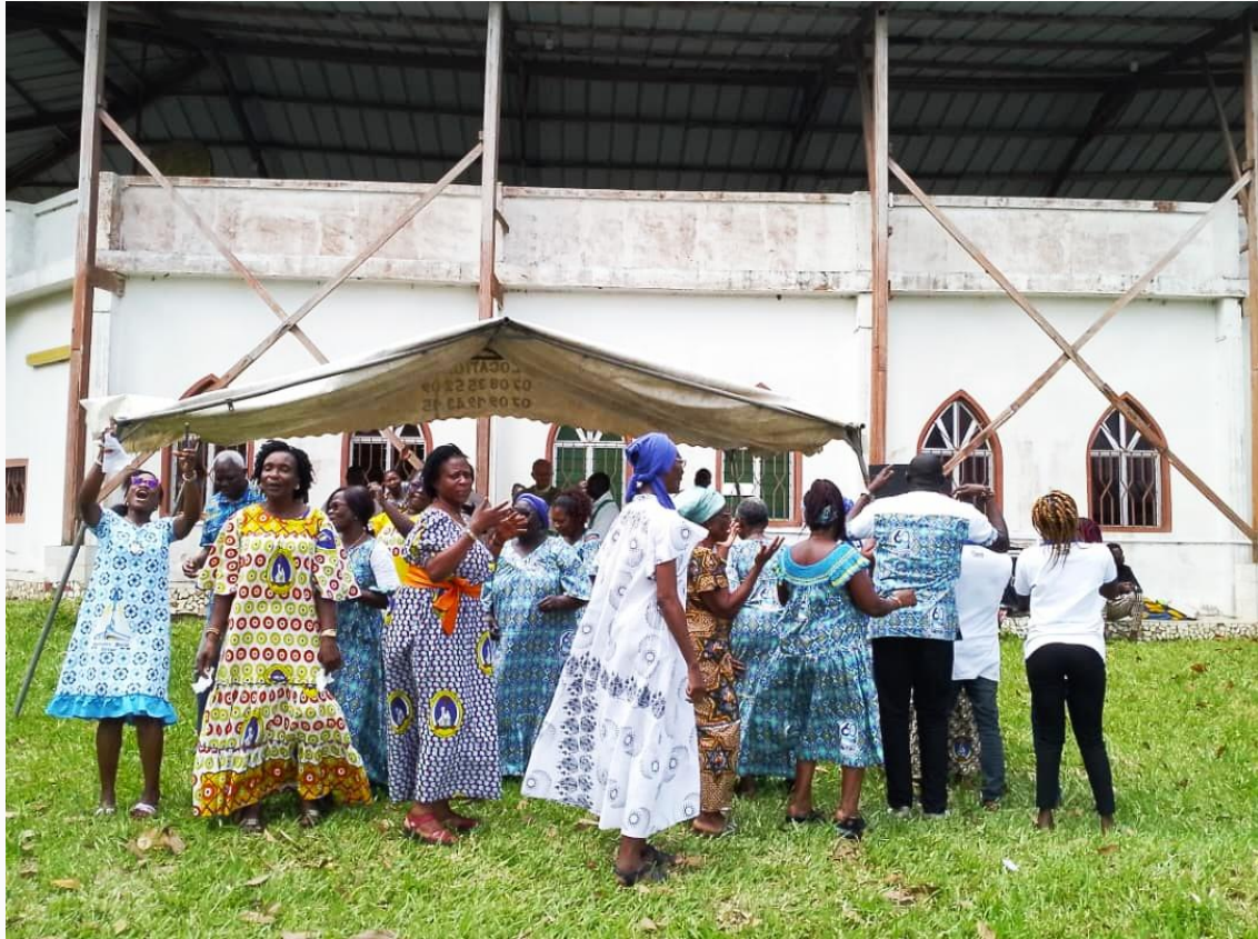
Abidjan - Ivory Coast