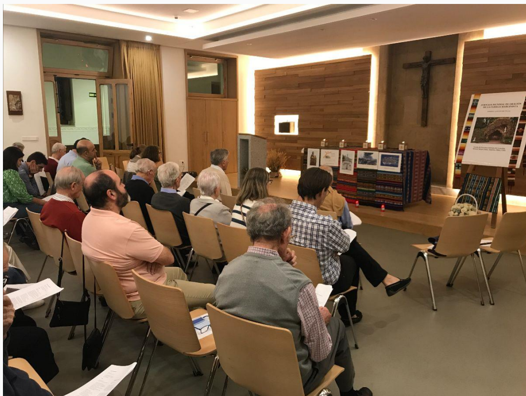
Colegio El Pilar, Madrid - Spain